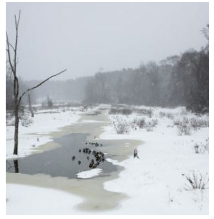
Two dozen geese huddle in a shrinking open hole of water as Janus arrives