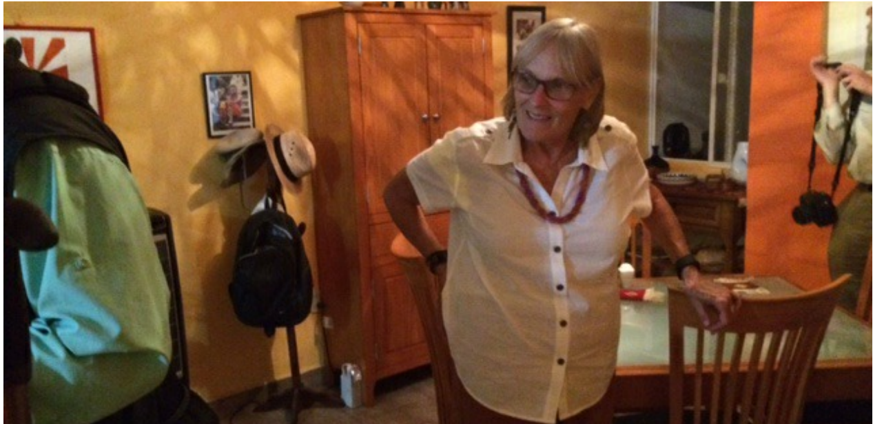
Focus Group Camera Club, Richmond, VA